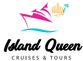
4-Color Logo w/ Spot Color (Black + Pantone 225, Pantone 319, Pantone 402)