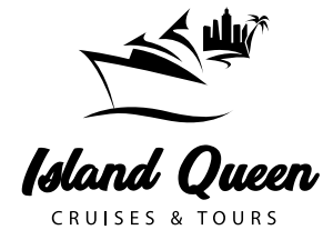
1-Color Logo (Black on White)