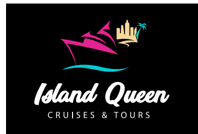
4-Color Reverse Logo w/ Spot Color (Black + Pantone 225, Pantone 319, Pantone 402)